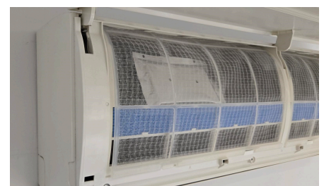
A/C Unit Air Treatment in Wall-mounted Unit