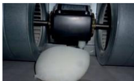
Duct Air Treatment in Ducted Unit