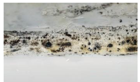
Presence of mould, fungus and mildew in the air conditioning systems