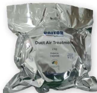
Unitor™ Duct Air Treatment (DAT)