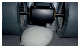
Easy to install