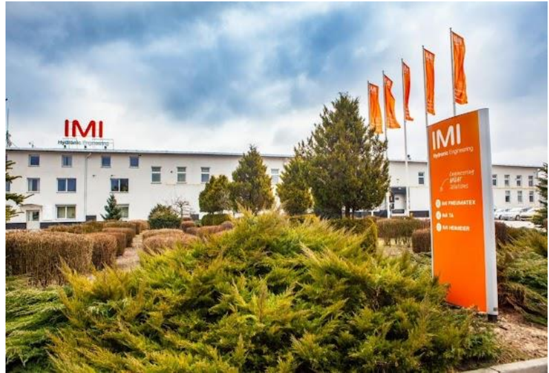
Figure 1 The view of IMI International Sp. z o.o. manufacturing plant located in Olkusz

As IMI Hydronic Engineering is a leading HVAC company with a valves montage plant located in Olkusz (Poland). Company is provider of technologies that deliver energy efficient water-based heating and cooling systems for the residential and commercial building sectors. Throughout the history, company have been at the forefront of HVAC industry innovation. The portfolio of brands has what is needed – a complete range of unique, industry-leading products and services. IMI Hydronic Engineering is a part of IMI PLC Group, listed on the London Stock Exchange on FTSE 100 list.