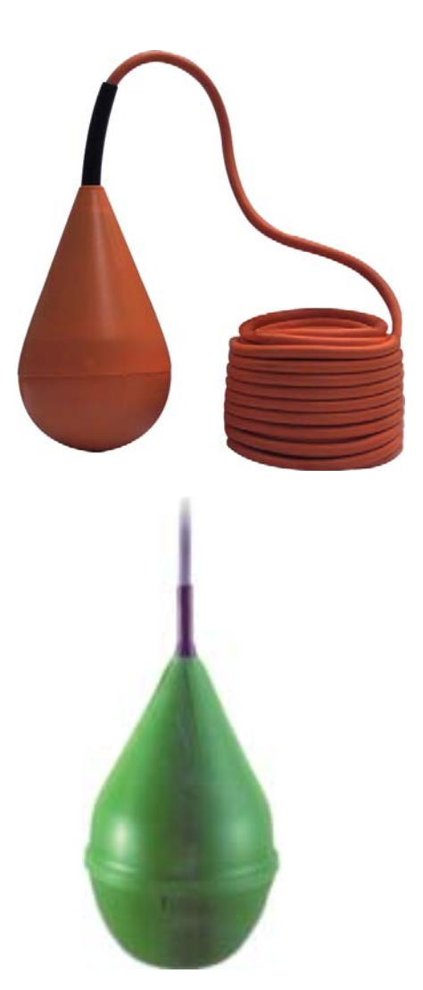
Type SLC-10E / SLC-20E / MS-1