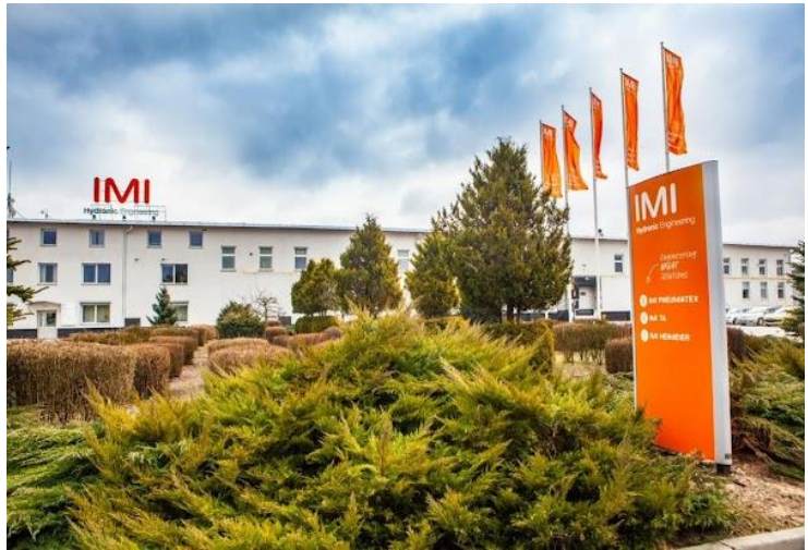
Figure 1 The view of IMI International Sp. z o.o. manufacturing plant located in Olkusz

As IMI Hydronic Engineering is a leading HVAC company with a valves montage plant located in Olkusz (Poland). Company is provider of technologies that deliver energy efficient water-based heating and cooling systems for the residential and commercial building sectors. Throughout the history, company have been at the forefront of HVAC industry innovation. The portfolio of brands has what is needed – a complete range of unique, industry-leading products and services. IMI Hydronic Engineering is a part of IMI PLC Group, listed on the London Stock Exchange on FTSE 100 list.