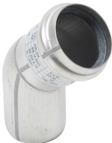
BEND 45°, Ø50MM - Syrefast stål: AISI316L/EN1.4404

Type nr.: 820.045.050 S EAN nr.: 5705499401318 VVS nr.: 160205350 RSK nr.: 1550289 NRF nr.: 2170754 LVI nr.: 0250682