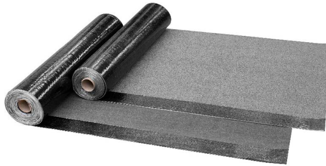
Figure 1. Picture of Icopal's Top & Base two-layer waterproofing system.

Top and Base is a two-layer waterproofing system from Icopal, made for roofs with particularly high demands on the waterproofing layer. The system consists of an upper layer (Top) and a lower layer (Base), both based on SBS-modified bitumen. SBS increases the elasticity of the waterproofing layer and provides increased joint strength and service life. Two separate waterproofing layers provide a good protection against leakage. The lower layer can also be used as a temporary seal while the rest of the roof is completed. Waterproofing system Top & Base is available in two versions; SV and K/KL, where SV stands for weldable and K/KL for glued (with hot asphalt) when installed. The seven products included in this LCA can be installed in the following combinations to form a two-layer waterproofing system: Base SV + Top SV, Base + Top, Base KL + Top KL, Base K + Top KL, Base SV + Base SV, Base K + Base K and Base KL + Base KL. Base SV and Base, Top and Top SV and Base K and Base KL are identical products but sold on different markets.