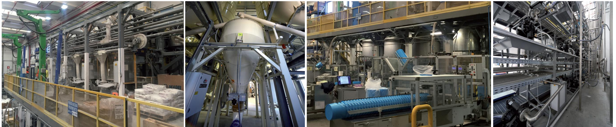
Figure 1: production process detail

The production process starts from raw materials, that are purchased from external and intercompany suppliers and stored in the plant. Bulk raw materials are stored in specific silos and added automatically in the production mixer, according to the formula of the product. Other raw materials, supplied in bags, big bags or tanks, are stored in the warehouse and added automatically or manually in the mixer. The production is a discontinuous process, in which all the components are mechanically mixed in batches. The semi-finished product is then packaged, put on wooden pallets and stored in the finished products warehouse. The quality of final products is controlled before the sale.