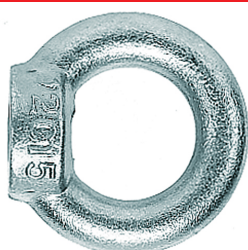
Ring nut RI