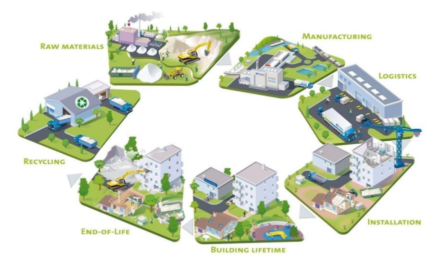
Figure 1 - Flow diagram of the life cycle stages from raw material extraction (A1) through to end-of-life

Figure 1 (below) is a flow diagram illustrating the system boundary from A1 - C4. Module D has not been modelled in this EPD. Biogenic carbon has not been included in the system boundary.