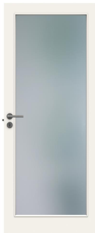
EPD HUB, HUB-0988

Published on 05.01.2024, last updated on 05.01.2024, valid until 05.01.2029.