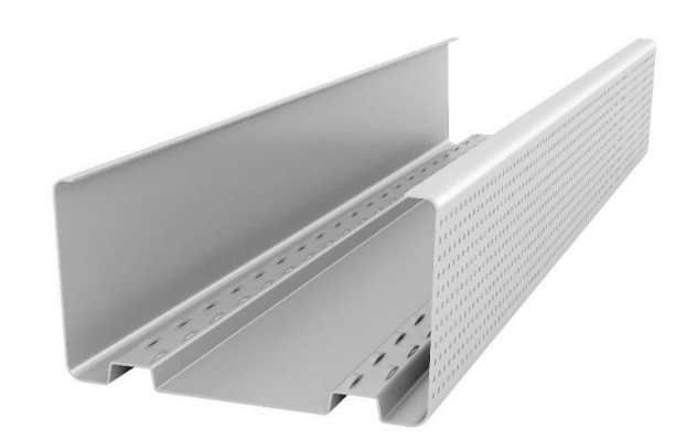
Figure 1. Illustration of one of the products within the product category Steel profile systems, for which this EPD is valid.