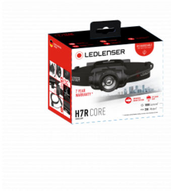
Exemplary Packaging Illustration