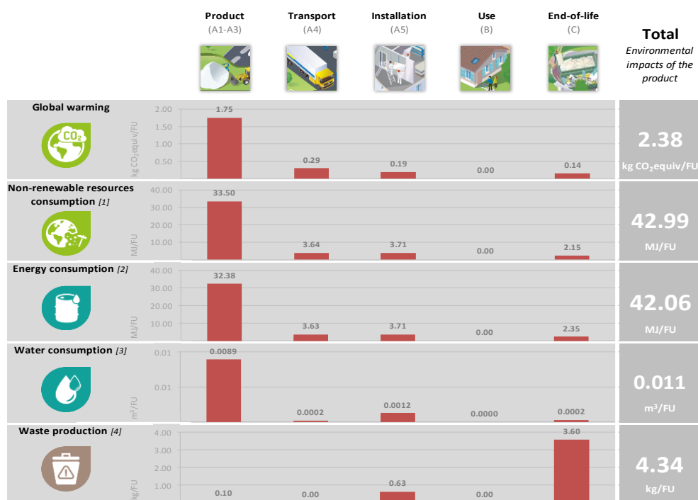
Figure 2: A summary graph illustrating the impact of 1 m2 of product (FU)

Reading example: 9,0 E-03 = 9,0*10 -3 = 0,009