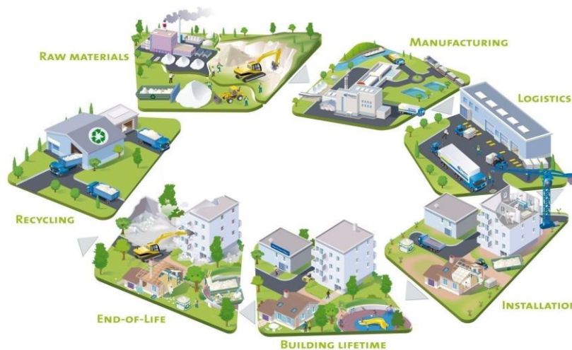
Figure 1 - Flow diagram of the life cycle stages from raw material extraction (A1) through to end-of-life

Figure 1 (below) is a flow diagram illustrating the system boundary from A1 - C4. Module D has not been modelled in this EPD. Biogenic carbon has not been included in the system boundary.