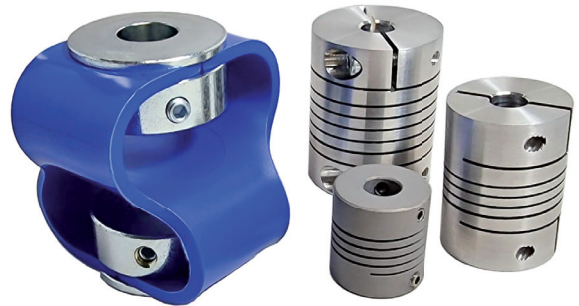
A Photograph Example of our Coupling Selections

The Primary job of couplings is to join together two pieces of rotating equipment while permitting some degree of misalignment or end movement or even both. By careful selection, installation and maintenance of couplings, substantial savings can be made in reduced maintenance costs and downtime and will help prolong your equipment's life.