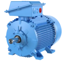
ABB IE3 CAST IRON MOTOR 4P 160KW 400VD FOOT MOUNT B3 IP66 3GBA312240-ADM