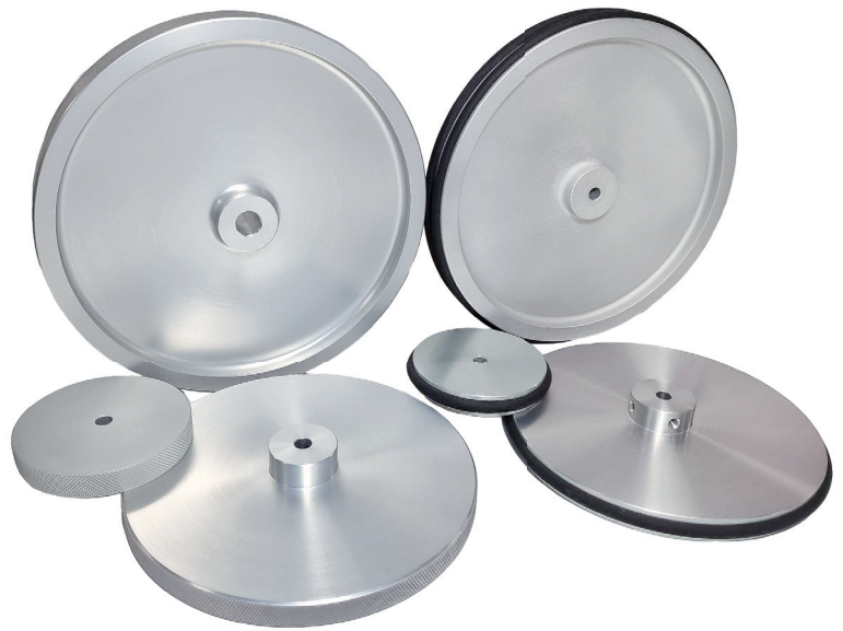
A Photograph Example of our Wheel Selections

The above recommendations are only guidelines. Performance may vary depending on your application. Contact Customer Service for specification assistance.