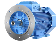
ABB IE3 ALUMINUM MOTOR 2P 22KW 400VD FOOT/BIG FLANGE MOUNT B35 IP55 3GAA181410-HDK