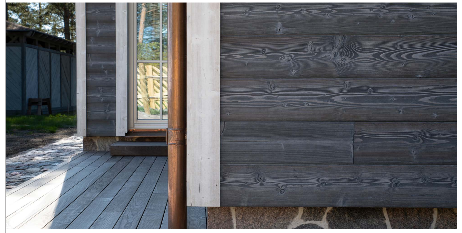
Drift Platinum and Sandy Pearl thermo-spruce cladding. Private house in Estonia