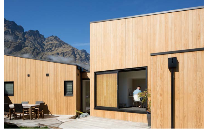
Benchmark thermo-radiata pine cladding. Jack's Point House in New Zealand