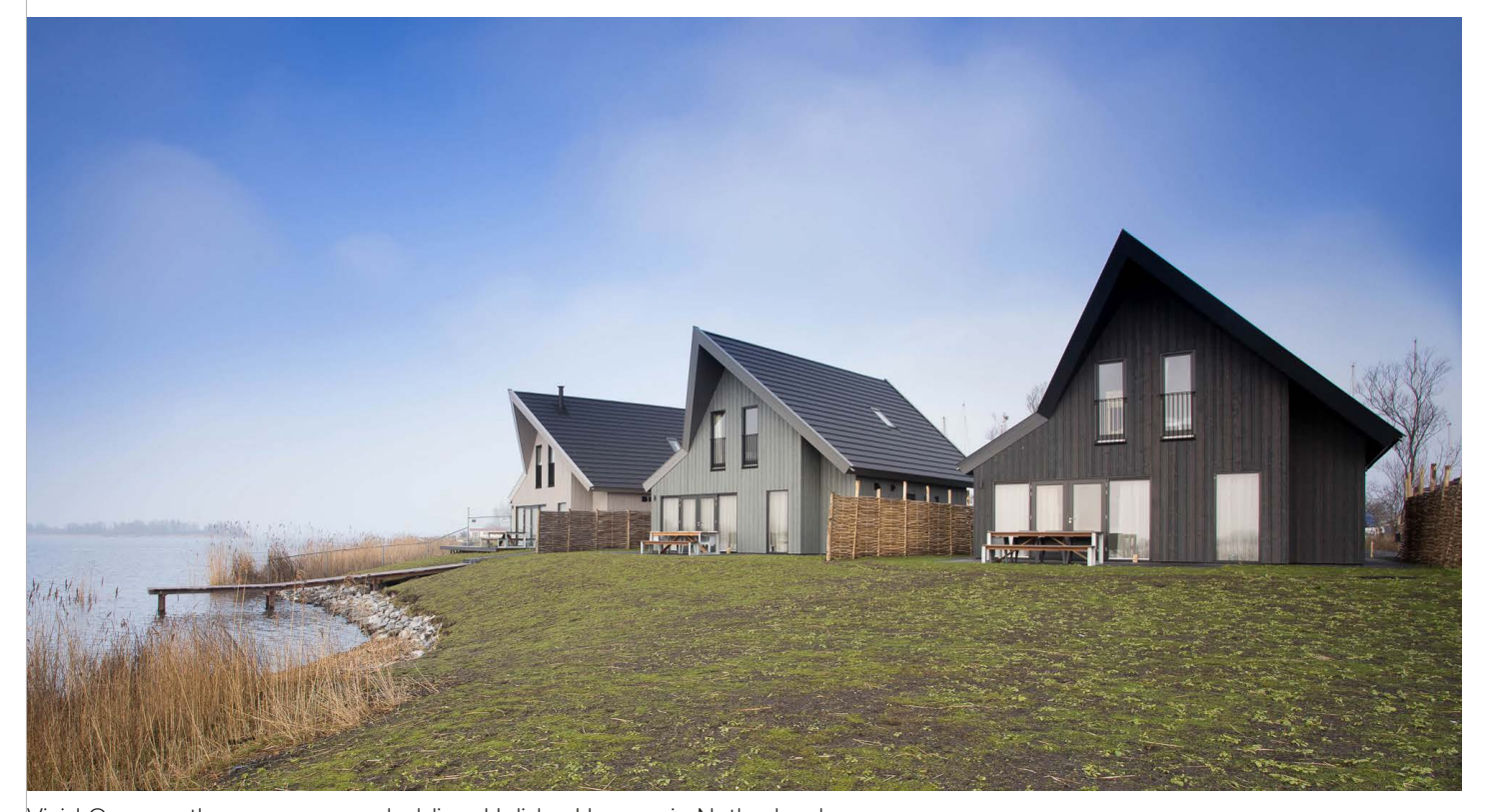
Vivid Opaque thermo-spruce cladding. Holiday Houses in Netherlands Distrubution & Photography InterFaca

For Vivid Opaque 15 cladding, we recommend applying a maintenance finish whenever the paint layer wears down to leave the cladding board with an uneven appearance, and at least every 15 years, with a water-based opaque paint that is approved for use on exterior thermally modified wood cladding