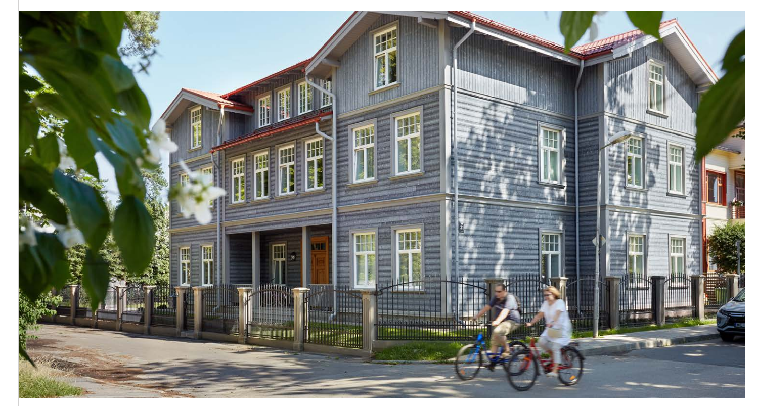
Drift Black Pearl thermo-spruce cladding. Private house in Latvia

We recommend leaving Drift cladding to weather naturally rather than repainting it, but if you would like to update your cladding with a fresh new look, it can simply be repainted with any paint that is approved for use on exterior thermally modified wood cladding. Test the suitability of the hue on a small area before applying the finish, and follow Thermory's finishing maintenance instructions.