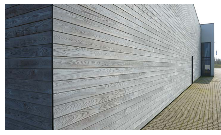
Unoiled Thermory Benchmark thermo-ash one year after installation Denmark