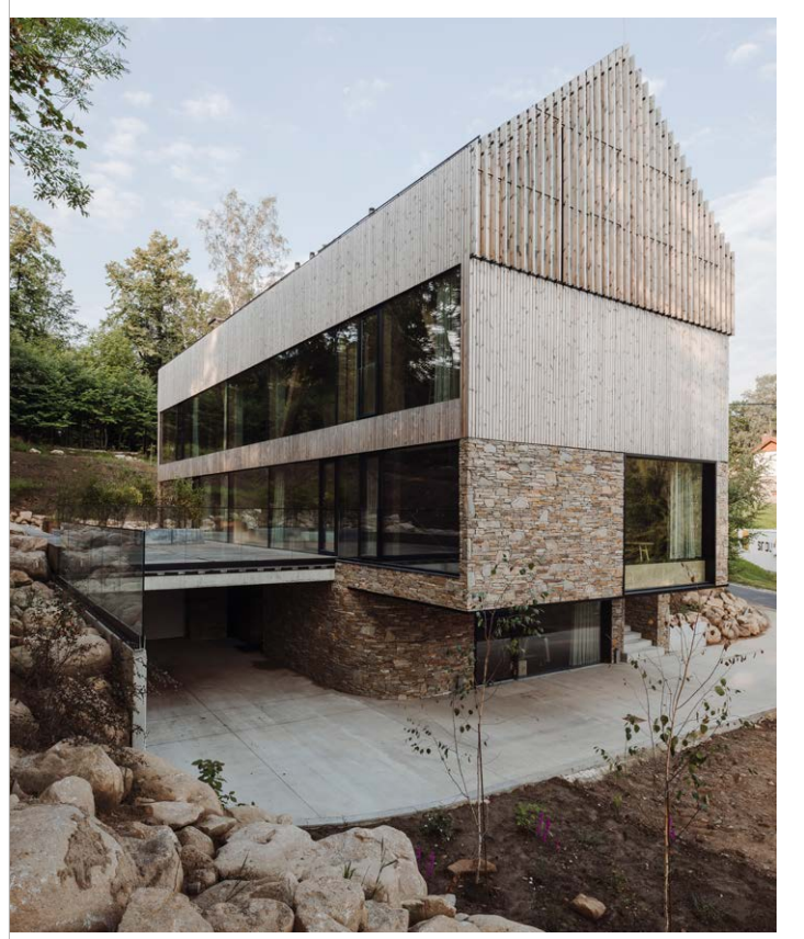
Unoiled Benchmark thermo-pine cladding and roofing one year after installation. Apartments in Poland Photo and distribution: Komplex Market