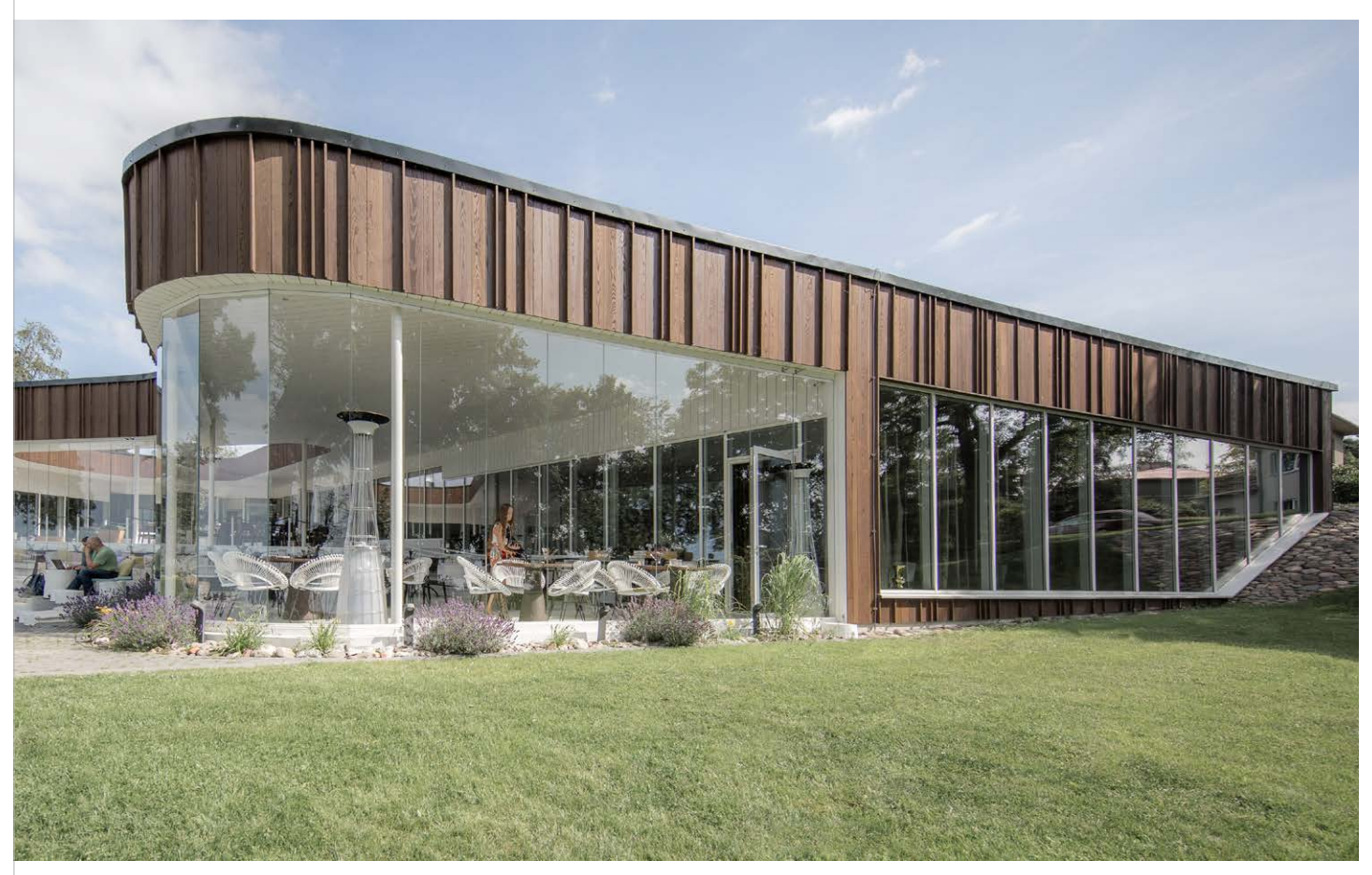
Oiled Thermory Benchmark thermo-ash cladding. NOA Restaurant in Estonia