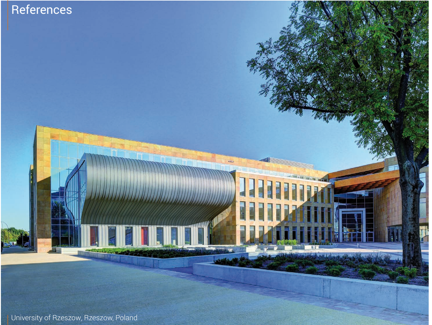
University of Rzeszow, Rzeszow, Poland