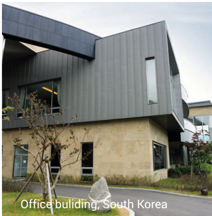
Office building, South Korea