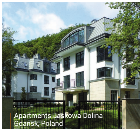
Apartments Jaskowa Dolina Gdansk, Poland