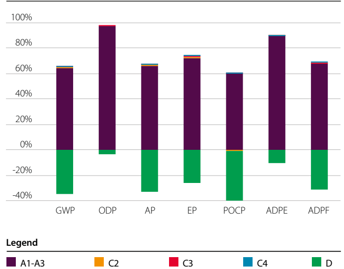
Figure 3 LCA results for the pre-finished steel

Referring to the LCA results table, the impact in Module D for the Use of Renewable Primary Energy (PERT) is different to other impact categories, being a burden or load rather than a benefit. Renewable energy consumption is strongly related to the use of electricity during manufacture, and as the recycling (EAF) process uses significantly more electricity than primary manufacture (BF/BOF), there is a positive value for renewable energy consumption in Module D but a negative value for non-renewable energy consumption.